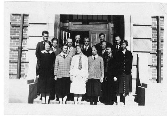
Bunbury High School Staff - 1927.

An extra week's holiday was granted in August to commemorate the visit to Perth by the Duke and Duchess of York.