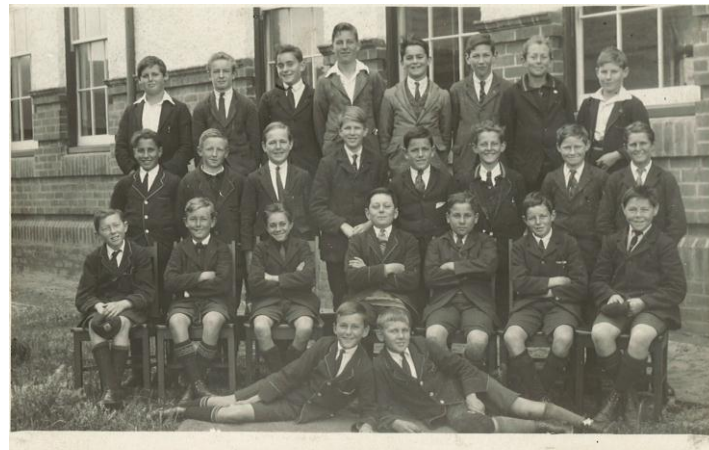
Form 1-C 1926.

Boys - knee length shorts, white shirts, white blazer, black shoes, white socks, trousers in winter. Straw hats were worn outside at all times.