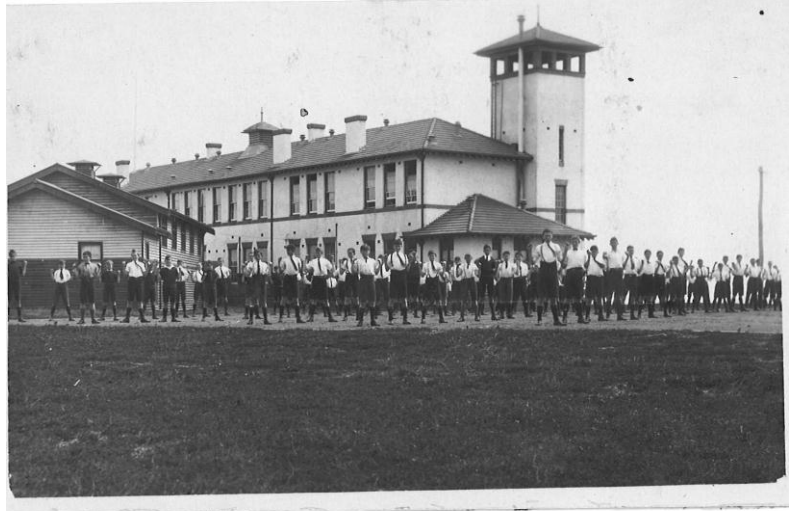
Bunbury High School Drill Squad - 1926.

Country Week sports was not held in Perth.