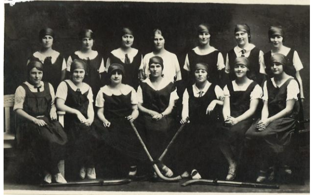
HOCKEY TEAM - 1925