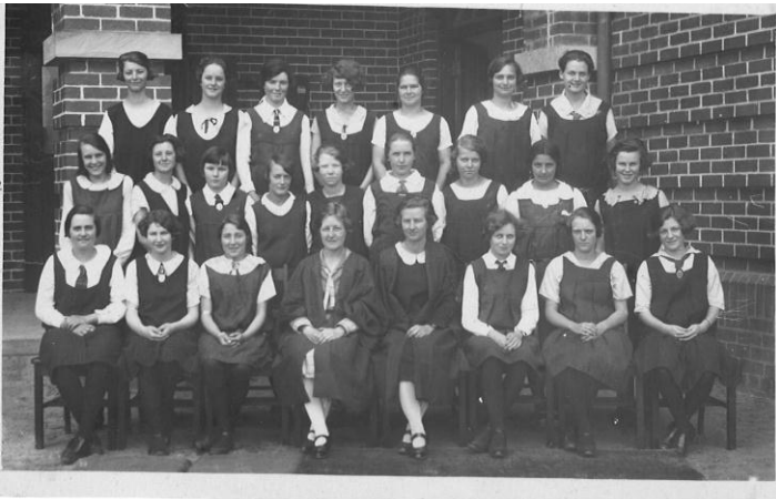
Form 2-E 1926.