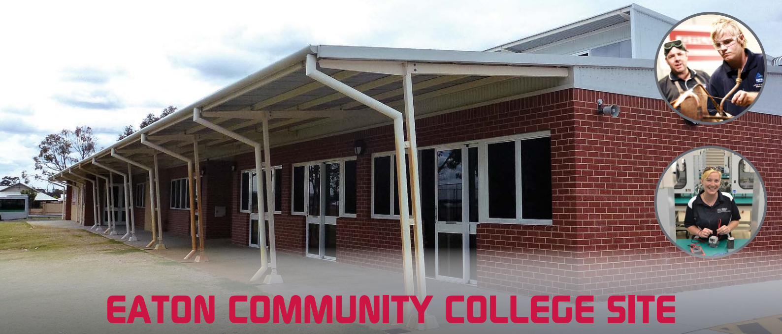
EATON COMMUNITY COLLEGE SITE