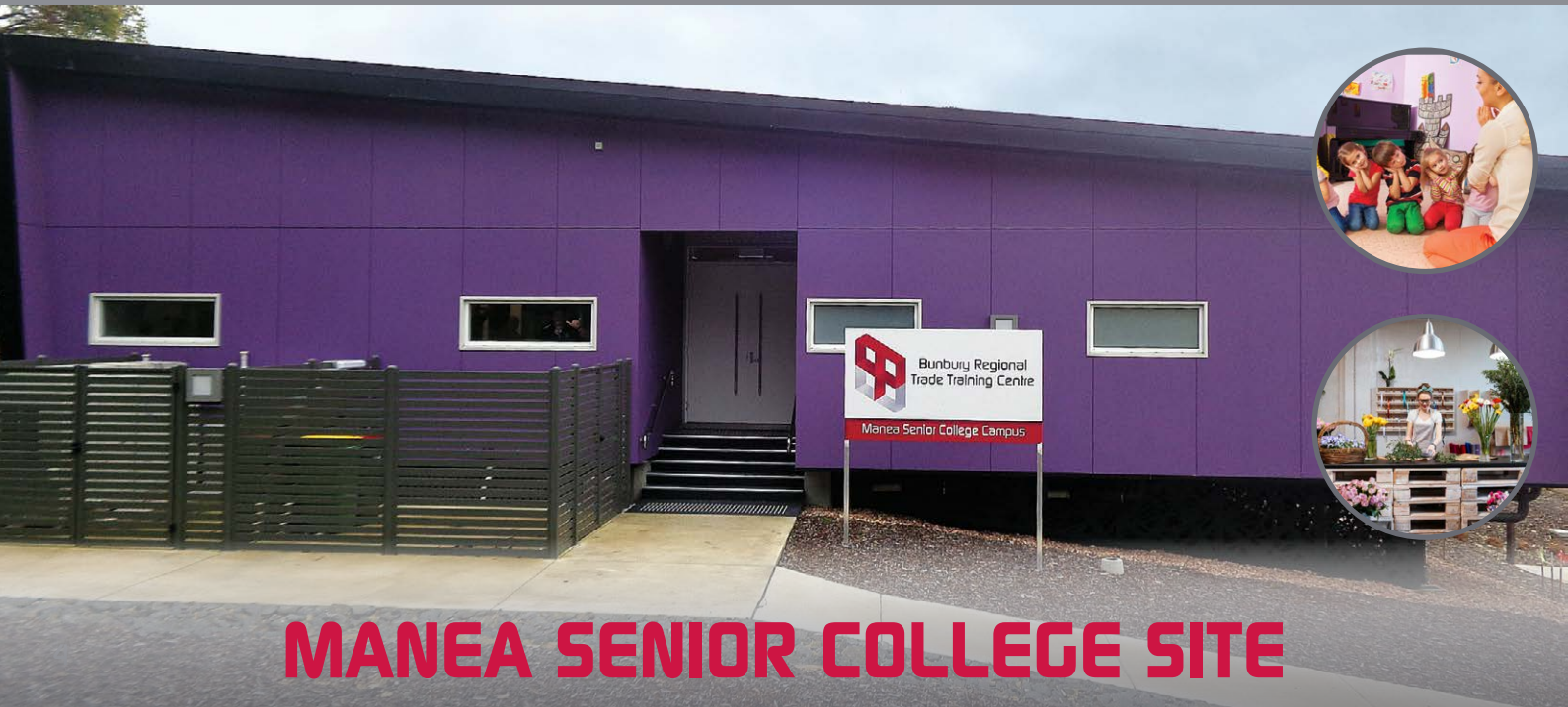
MANEA SENIOR COLLEGE SITE