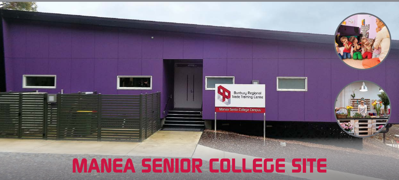
MANEA SENIOR COLLEGE SITE